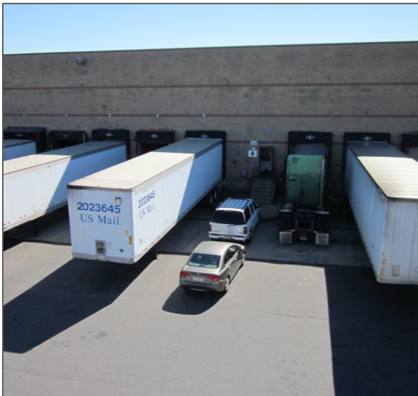
Loading Docks and Trash Dock